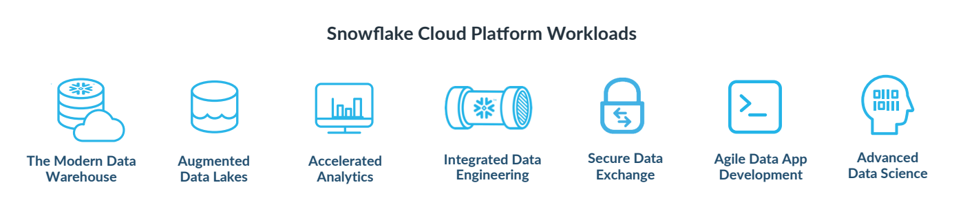
Figure 1: Snowflake enables many use cases and workloads in addition to data science, so your organization can leverage the power of a single platform for data, analytics, and predictive analytics.